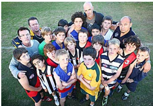
Footy fans at Yarraville Oval are unhappy about the AFL's twilight footy matches on Sundays because their children are too tired for school the next day.